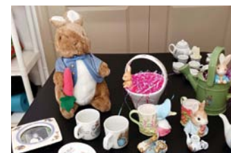
Some of the donated Beatrix Potter collectibles.