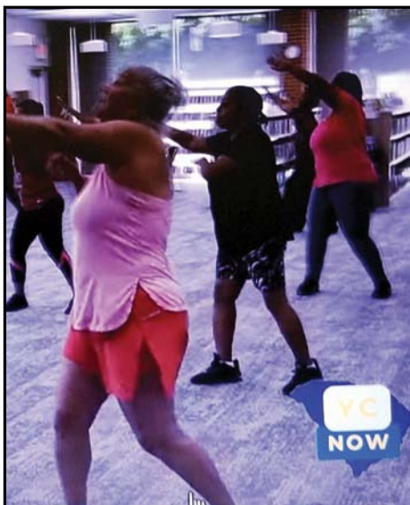
A Zumba class at the Rock Hill Library.